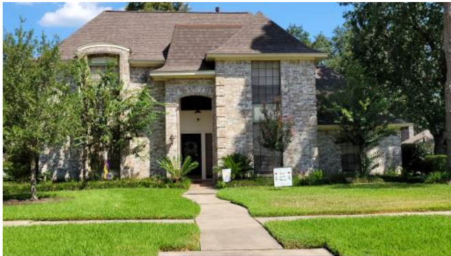
1803 Ash Forest Drive September