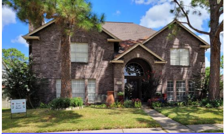
22402 Wildwood Grove Drive August