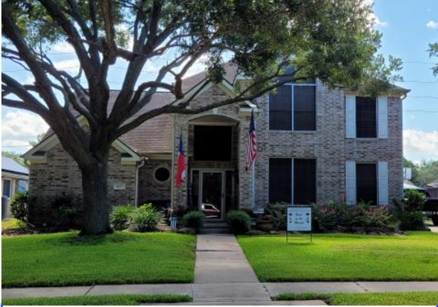
1827 Cornerstone Place Drive July