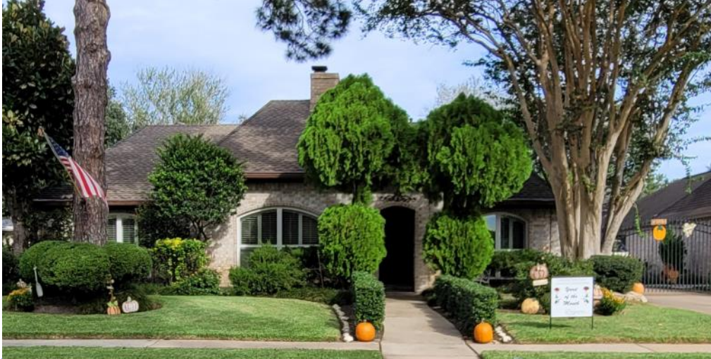
1811 Ash Forrest Drive The Graham Family