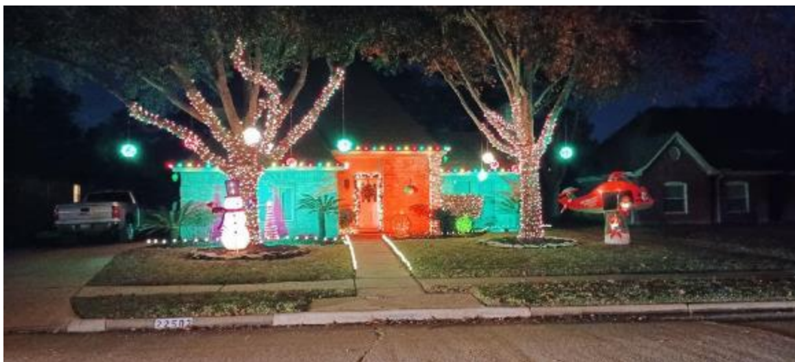
22502 Cove Hollow Drive The Oliver Family