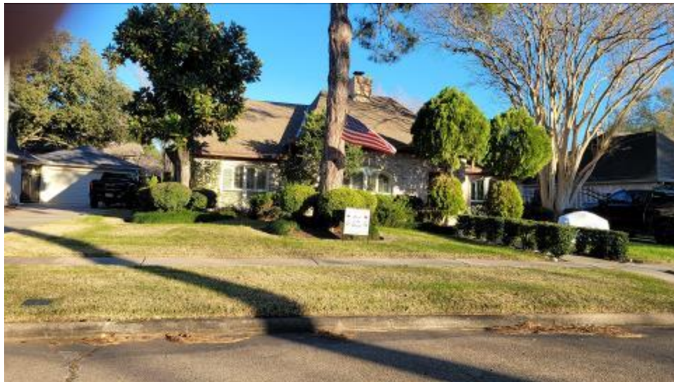
1804 ASH FOREST The Graham Family