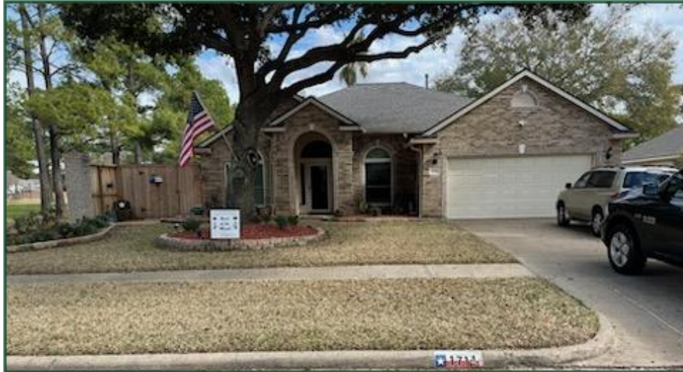
1711 Brook Grove The Fluitt Family